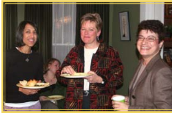
“Emory Women in Radiology” gathering