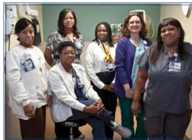
In the Pre-Procedure Care Area (PPCA) the Radiology Nurses prepare patients for their invasive procedures.

Prior to a patient's procedure, the nurse reviews the medical history and prepares the patient by explaining what they can expect during his/her procedure. The nurses document medication, vital signs and response rates throughout the patient's stay. They also communicate on behalf of the patient during a procedure to the faculty and staff, which is an important aspect of this position. While a patient is on the examination table, a radiology nurse is always with him/her to