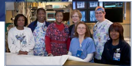
Emory University Hospital's Interventional Radiology team works closely with Radiology Nurses for patient procedures.

utmost respect and receive the highest quality of care.