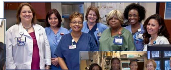
Radiology Nurses at Emory University Hospital Midtown emphasize their successful teamwork.