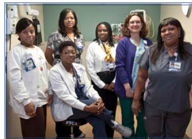
In the Pre-Procedure Care Area (PPCA) the Radiology Nurses prepare patients for their invasive procedures.

Prior to a patient's procedure, the nurse reviews the medical history and prepares the patient by explaining what they can expect during his/her procedure. The nurses document medication, vital signs and response rates throughout the patient's stay. They also communicate on behalf of the patient during a procedure to the faculty and staff, which is an important aspect of this position. While a patient is on the examination table, a radiology nurse is always with him/her to