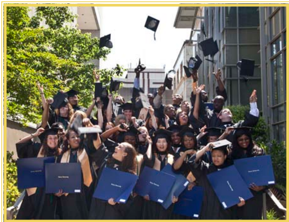
The Medical Imaging Program Class of 2011 plans to use their new-found knowledge as they begin their careers in the field of medicine.

On May 9, 2011, 29 Emory Graduates celebrated as they received their Bachelor's Degree in Medical Imaging. Through the Emory Medical Imaging Program, aspiring Radiology Technologists (RT), along with practicing RTs, are given the opportunity to specialize their skills as an RT in the areas of CT, MR, education or administration. This year, 21 graduates completed their program with a focus in MR, five in CT, one in education and two in administration.