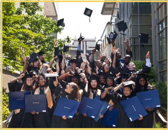
The Medical Imaging Program Class of 2011 plans to use their new-found knowledge as they begin their careers in the field of medicine.

On May 9, 2011, 29 Emory Graduates celebrated as they received their Bachelor's Degree in Medical Imaging. Through the Emory Medical Imaging Program, aspiring Radiology Technologists (RT), along with practicing RTs, are given the opportunity to specialize their skills as an RT in the areas of CT, MR, education or administration. This year, 21 graduates completed their program with a focus in MR, five in CT, one in education and two in administration.