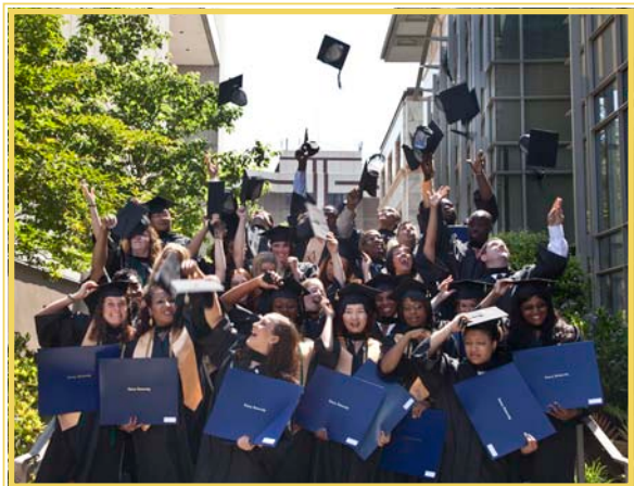
The Medical Imaging Program Class of 2011 plans to use their new-found knowledge as they begin their careers in the field of medicine.

On May 9, 2011, 29 Emory Graduates celebrated as they received their Bachelor's Degree in Medical Imaging. Through the Emory Medical Imaging Program, aspiring Radiology Technologists (RT), along with practicing RTs, are given the opportunity to specialize their skills as an RT in the areas of CT, MR, education or administration. This year, 21 graduates completed their program with a focus in MR, five in CT, one in education and two in administration.