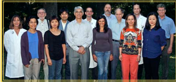
The RDL collaborates with nine departments within the Emory School of Medicine, two Georgia Universities, six additional Universities and Institutes in the US and Europe, and three corporations.