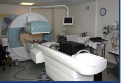
The assembly of a new Nuclear Medicine Suite will allow for more children to receive specialized care.

According to research published in the December issue of the Journal of Nuclear Medicine, PET/CT has exhibited significantly higher sensitivity, specificity and accuracy than conventional imaging for detecting malignant tumors in children. This advancement may help radiologists to identify small tumors in children and guide selection of the most effective course of treatment at an earlier disease stage.