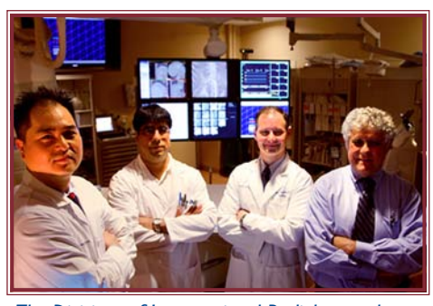
The Divisions of Interventional Radiology and Nuclear Medicine have collaborated to streamline the clinical use of Y-90 cancer treatment.