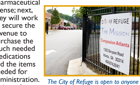
willing to work to get their life back on track

was the need for her patients to experience humanity. She describes the experience as phenomenal and explained, "When they leave they feel like somebody has listened to them and touched them.