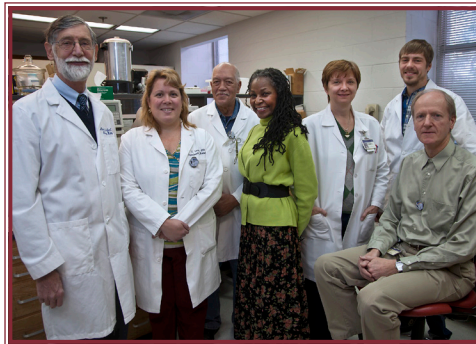
The Radioligand and Expert System Research Lab is aimed at enhancing patient care by focusing on advancing support tools and scans.