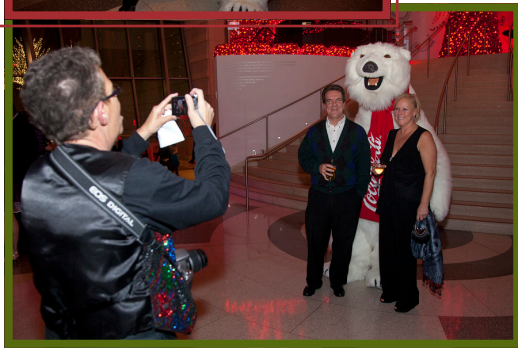
The World of Coca-Cola's Polar Bear was a big hit this year.

smiles beamed from one face to another. Familiar faces and new introductions lasted throughout the evening as the guests enjoyed the perfect opportunity to unite. Those who attended the event enthusiastically mingled with a special visitor, the Coca-Cola Polar Bear who also attended the festive celebration. The retail store was open exclusively for our Department all evening as guests used the opportunity to purchase holiday gifts or souvenirs. Faculty and staff even received a commemorative bottle of Coca-Cola to help them remember the joyous occasion.