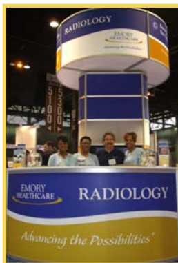
Members of Marketing, IT and Administration formed the team that planned, executed and manned the Emory booth.

The Emory technical exhibit booth put Emory on everyone's lips – literally and figuratively. Not only did radiology professionals seek our booth for the very popular chapstick give-a-way, but they also wanted to know "What is Emory doing here?" The Emory booth staff and volunteer faculty members had a chance to represent the radiology department on topics ranging from teleradiology to the medical imaging program and what positions we have open to when Emory presentations would be taking place at the conference. The Emory booth was used to its full extent promoting