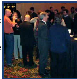
Guests of the Emory Alumni Reception enjoy catching-up.