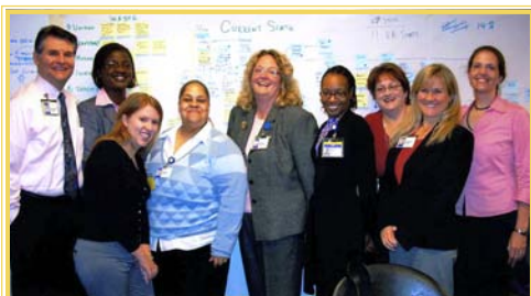
Members of Medical Oncology & Radiology team up to create an interdepartmental team to streamline the radiology reordering process.

Radiology and Medical Oncology have teamed up to streamline the Radiology ordering process between