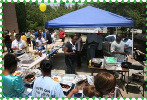
The coding & billing group at Decatur plaza geared up for the employee Gallup Poll with the second-annual grill-out.

The Reimbursement Services Department recently celebrated another successful year of improving employee engagement at their 2nd Annual Gallup Luncheon on Friday, July 18th.