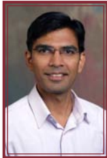
Chesnal Arepalli Division of Cardiothoracic Imaging