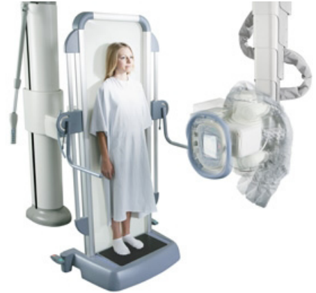
The new digital room at Emory University Hospital features the GE Definium 8000 digital radiography system.

At Emory Crawford Long Hospital, one 1.5T MRI installed in May, one gamma camera installed in April and one PET/CT pending