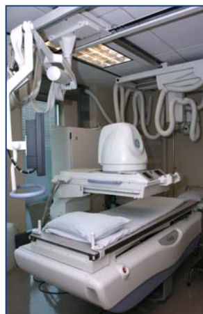
The addition of a Fluoro room at Executive Park will complement the services already offered at this location.