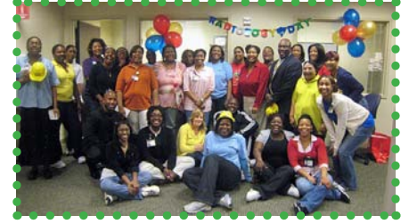
Employee morale is kept high throughout the year with smaller events such as Pass the Hat team building.

morale booster is the Employee Birthday Club. Joining the Employee Birthday Club allows everyone to feel exceptional on his or her special day by receiving a gift card of their choosing and a gift item as well as cake and ice cream during the middle of the month to celebrate every birthday for the entire month.