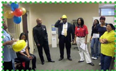
Team members share recognition quarterly with a "Pass the hat" celebration.

The team made sure to thank people outside of their area by inviting them to their luncheon. In attendance were people from EMCF, Grady, IS, Netcom, Security, PFS, etc.