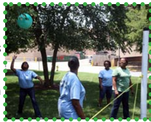
The grill-out was followed by a game of volleyball.

The Management team led the way by illustrating that employees opinions do count during the daily huddles. To increase the lines of communication, the team created a Huddle Calendar and increased the frequency of departmental meetings. Implementing those two major components in their daily operations (along with others) has given the staff the opportunity to discuss topics more frequently and deal with issues faster. There has been a great boost in the staff's morale since the changes have been made to the huddle format.