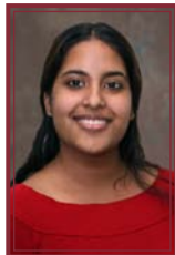
Sima Banerjee Division of Musculoskeletal Imaging