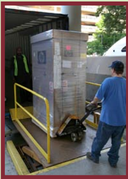
The PACS servers arrived in October and are in the first state of installation.