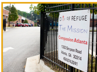
The City of Refuge is open to anyone willing to work to get their life back on track.