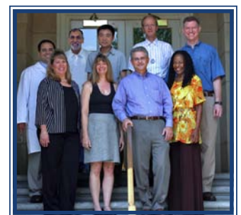
The Nuclear Cardiology R&D Laboratory Team is internationally recognized for their scientific research.