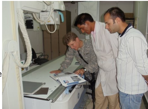
Three of the eight technologist in Afghanistan review the possibilities of their new portable X-ray machine.

We are addressing very basic issues and needs in the department, such as infection control, exam procedures, and continuing education. One of our primary areas of focus is Radiation Safety. This includes issuing radiation badges for technologists, with planned radiation exposure monitoring at least every two months. The Department Head for Radiation Safety and Protection at the Ministry of Public Health will conduct a Radiation Survey and a Radiation Safety Lecture for the technologists.