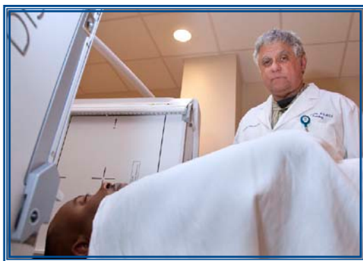
Since July 5th, more than 10 patients have undergone the DaTscan. Several more patients are scheduled for scans in the future at Emory.

Dr. Barron explains, "Patients who undergo the scan follow a series of preparatory procedures. Three days prior to the DaTscan procedure the patient is asked to stop all interfering medication. One hour before DaTscan is administered, the patient will receive an oral iodide solution to block the thyroid from iodine uptake. The DaTscan radiotracer is slowly administered intravenously in an arm vein and there is then a four-hour wait to allow for radiotracer binding to brain structures. The scan takes approximately 30 minutes."